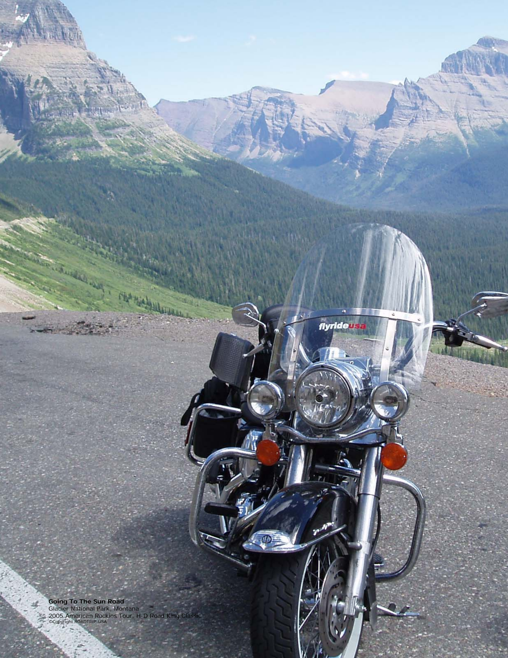
Going To The Sun Road Glacier National Park, Montana 2005 American Rockies Tour, H-D Road King Classic