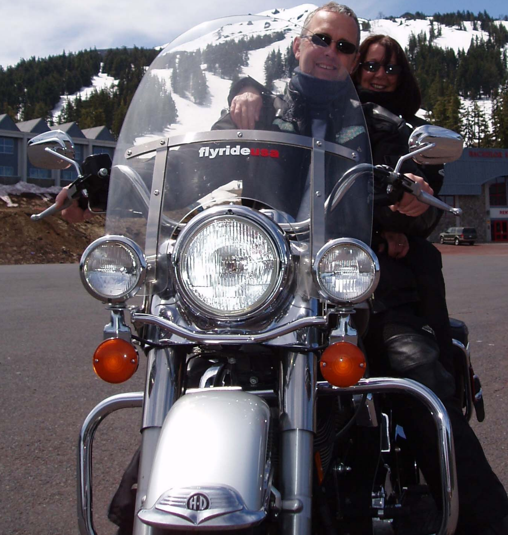
Mt Bachelor Three Sisters Wilderness Area, Oregon 2006 California Dreaming Tour, H-D Road King Classic