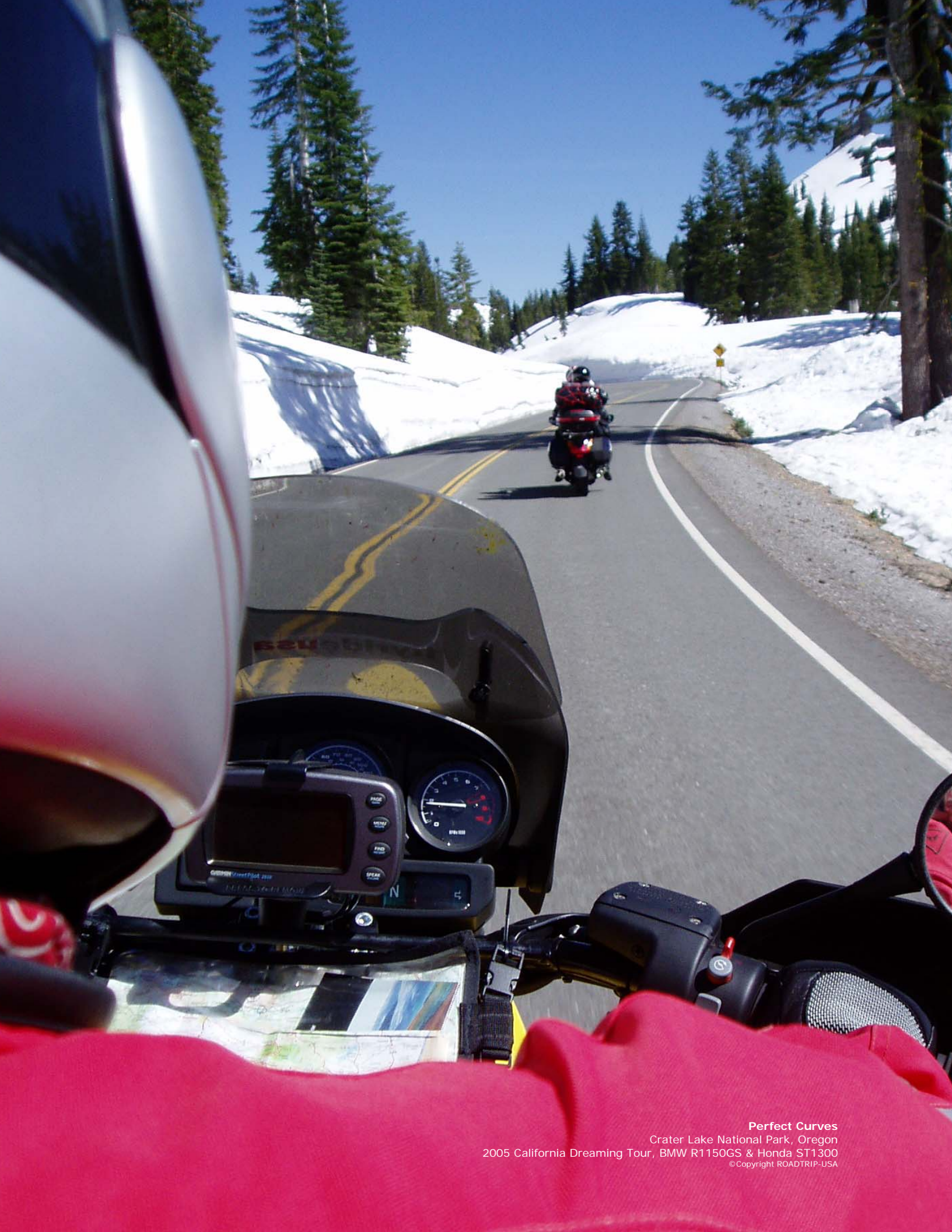
Perfect Curves Crater Lake National Park, Oregon 2005 California Dreaming Tour, BMW R1150GS & Honda ST1300